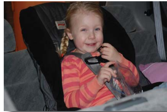
Car seats for the Delaware General Health District