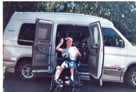
Wheel chair lift for a community member