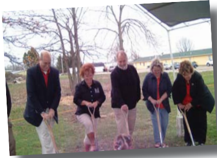
Edison Enterprise Baptist Community Food Pantry

Since Morrow County and Delaware County Electric combined to form Consolidated Electric in 1996, the cooperative has been dedicated to helping the people in our service area live better lives, not only with affordable electric power, but through our involvement in a number of important community endeavors.