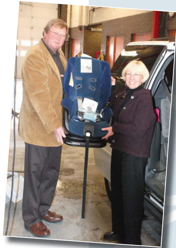
Car seats for the Delaware General Health District